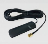
WiFi / BT Antenna