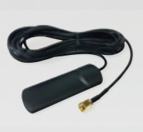
WIFI / BT Antenna