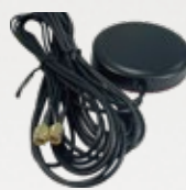
WIFI / BT Antenna